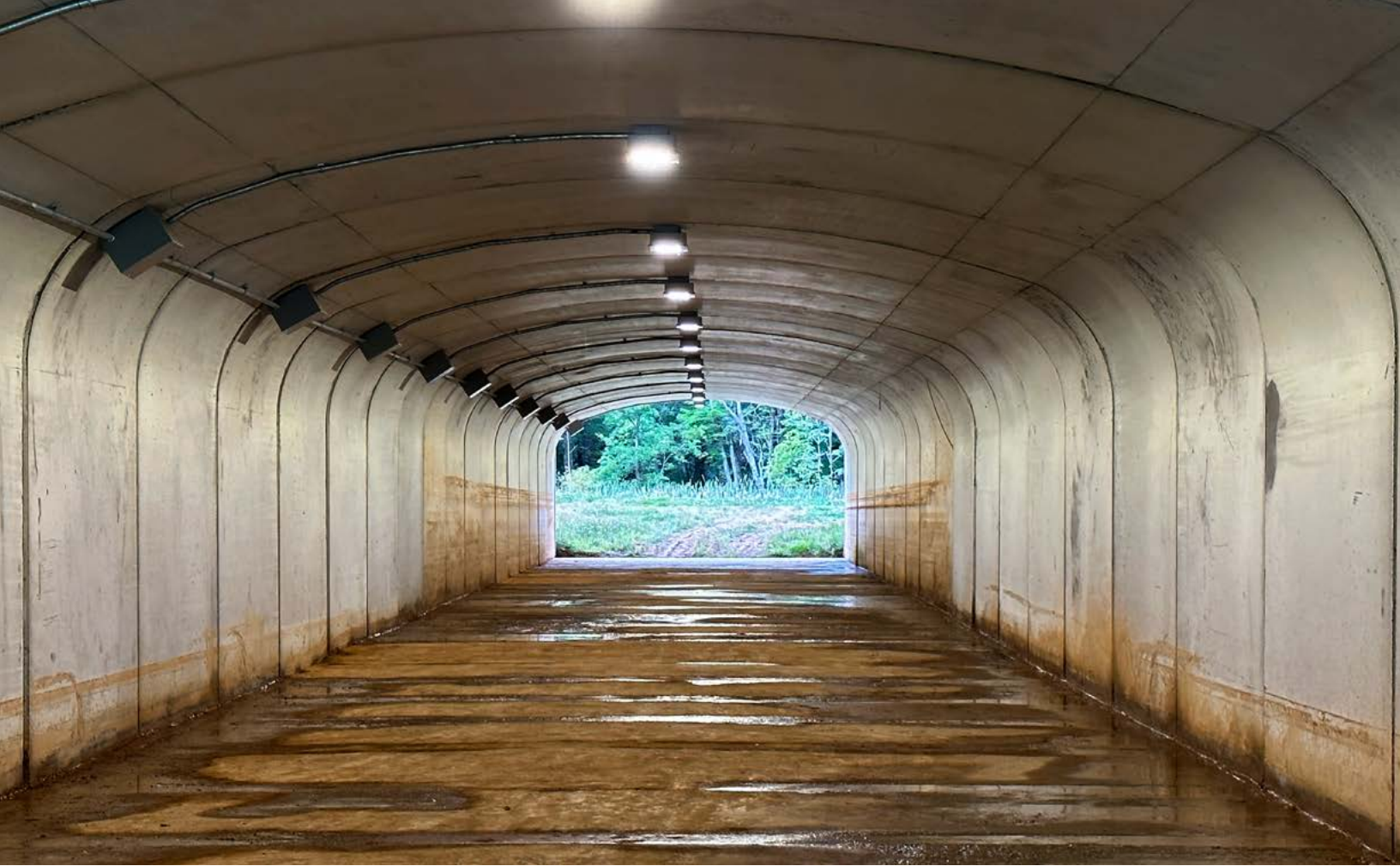
Above: Under Construction— Route 7 Corridor Improvements. Pedestrian underpass.