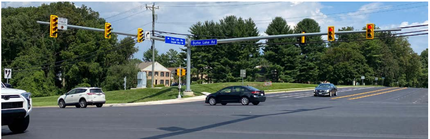
From top: Recently Completed Intersection Improvements— Columbia Pike and Lacy Boulevard, Columbia Pike and John Marr Drive, and Burke Lake Road and Shiplott Boulevard.