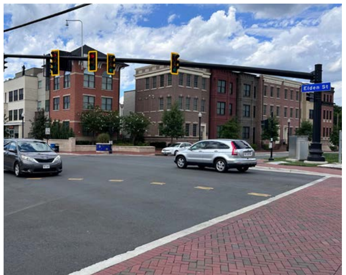
From top: Projects In Design — Braddock Road Multimodal Improvements; Compton Road Shared-Use Path; Elden Street Widening and Underground Utilities Duct Bank