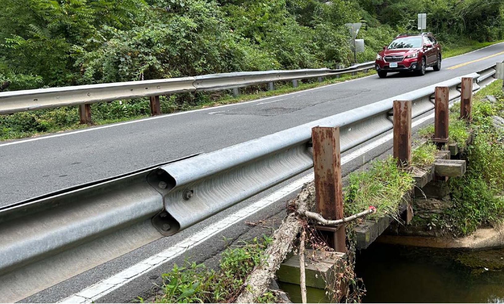
Above: In Design — Walker Road over Piney Run Bridge Replacement

markings and signs. Construction on the final improvements is scheduled to begin in late 2025.