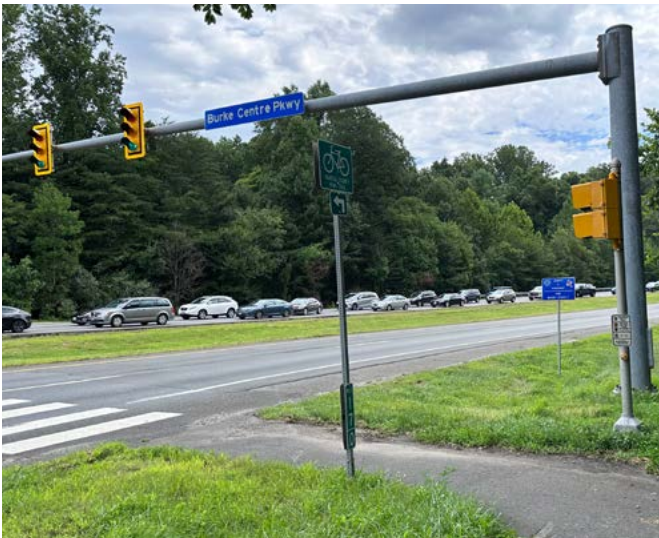
From top: In Design — Fairfax County Parkway Widening at Burke Center Parkway.