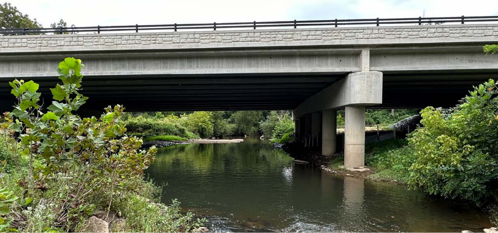
Above: Under Construction— Route 7 Corridor Improvements. Bridge over Difficult Run. Below: Under Construction— Route 7 Corridor Improvements. Leesburg Pike at Lewinsville Road.