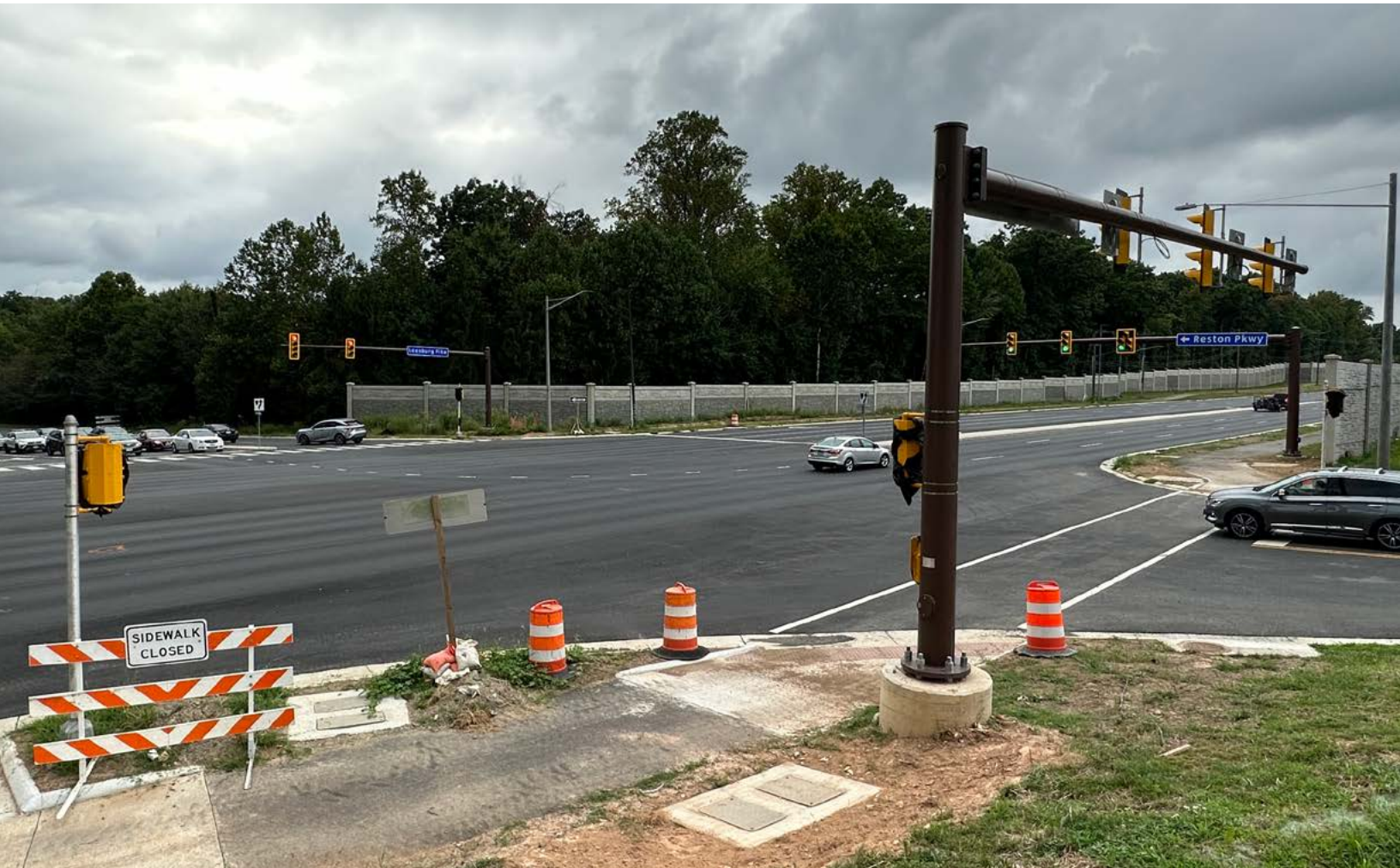
Below: Under Construction— Route 7 Corridor Improvements. Leesburg Pike at Reston Parkway.